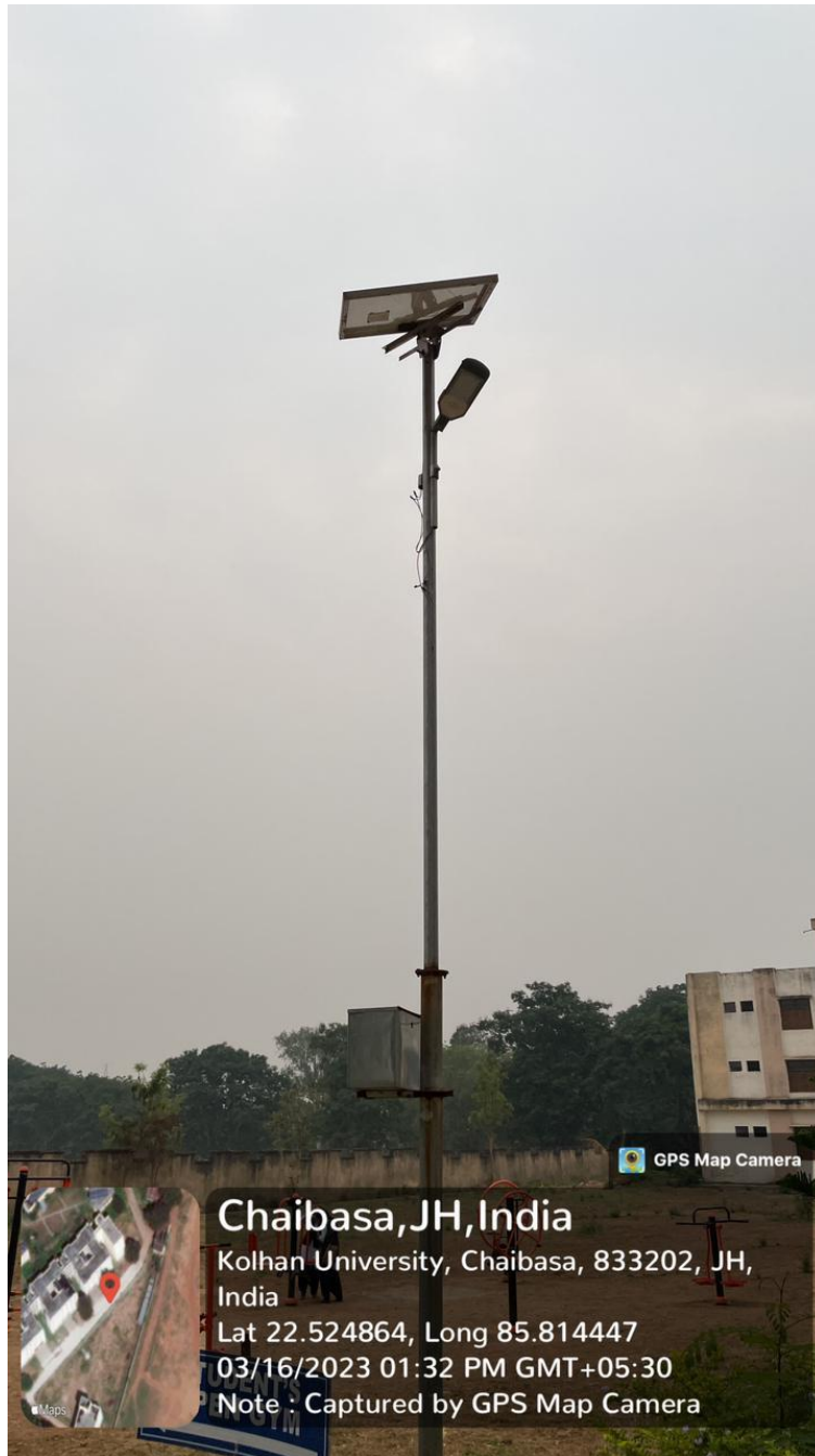
Figure: Solar energy powered LED street lights in the university campus